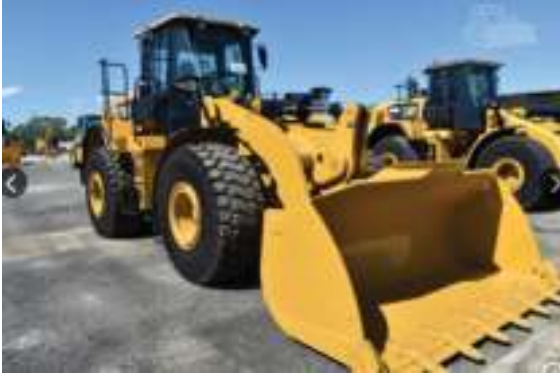
Second hand low hours Cat 950 GC Wheel Loader complete with Bucket adaptors and teeth and spare wheel.