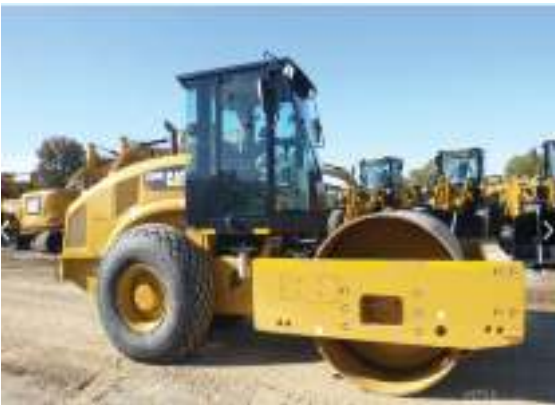
Second hand low hours Cat CS64 B with cat compaction meter value CMV. This machine has low engine hours.