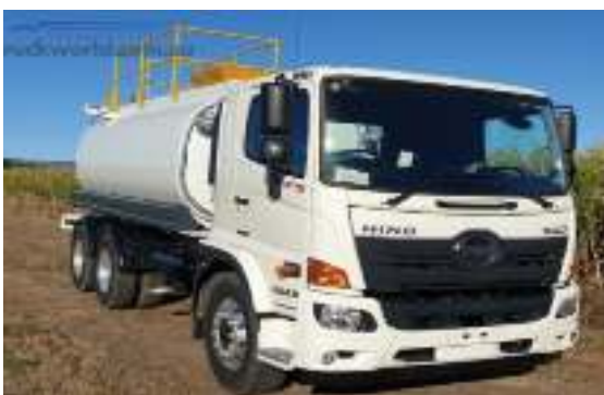
New Hino FM2628 6x4 New Water Truck

Jawoyn Contracting and Civil have a fleet of vehicles, equipment and tools available for use and hire. If a job requires more, then we will draw on our network of local providers to ensure the best tools and equipment are sourced to complete the job. We are proud of our long-established relationships with our local suppliers.