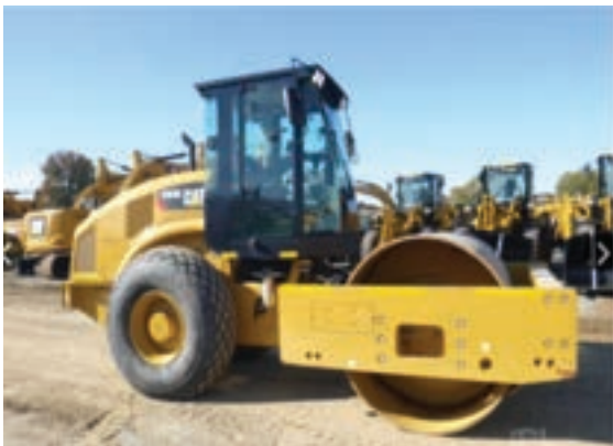
Second hand low hours Cat CS64 B with cat compaction meter value CMV. This machine has low engine hours.