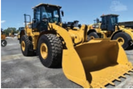
Second hand low hours Cat 950 GC Wheel Loader complete with Bucket adaptors and teeth and spare wheel.