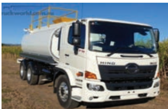
New Hino FM2628 6x4 New Water Truck

Jawoyn Contracting and Civil have a fleet of vehicles, equipment and tools available for use and hire. If a job requires more, then we will draw on our network of local providers to ensure the best tools and equipment are sourced to complete the job. We are proud of our long-established relationships with our local suppliers.